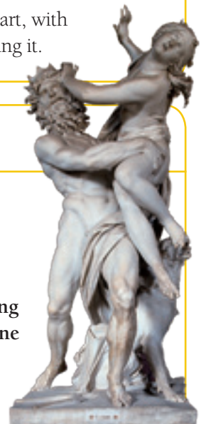
Hades kidnapping Persephone

f. Before dawn on the third day after death, the body was wrapped in a shroud and taken to the graveyard on a cart, with a procession following it.