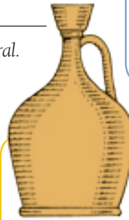
Flask of oil

a. The body was cremated or buried. The body or its ashes were buried with some possessions.